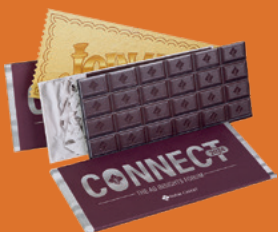
BEST OF CATEGORY Announcements & Invitations