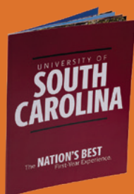
BEST OF CATEGORY Sheetfed Catalogs