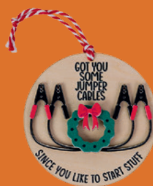
BEST OF CATEGORY Wide Format Printing Other