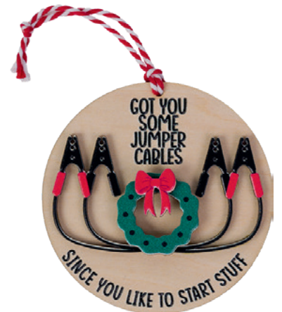
BEST OF CATEGORY Wide Format Printing Other