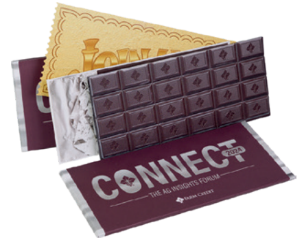
BEST OF CATEGORY Announcements & Invitations