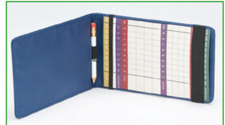
(Min. order quantity 50 holders.)