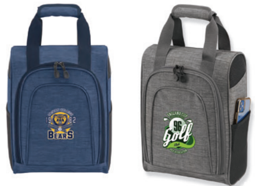
(Min. order quantity 20 bags.)