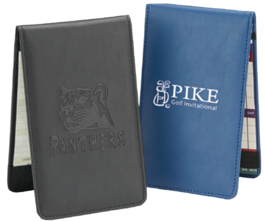
Colors: Black, Navy

As low as $7.00 each (plus shipping and handling)