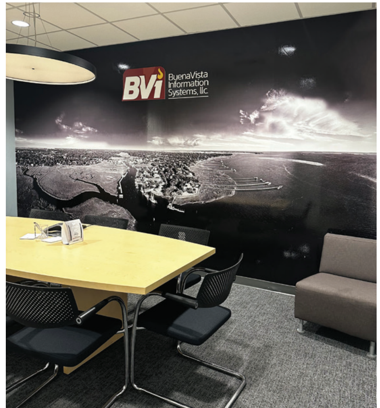
Vinyl wall mural with logo printed and cut on acrylic.

To enhance the aesthetics for your office environment, give us a call or email!