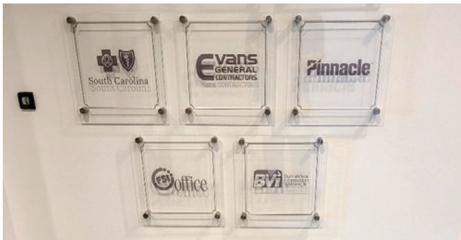
Sponsor logos printed on acrylic, mounted on standoffs.