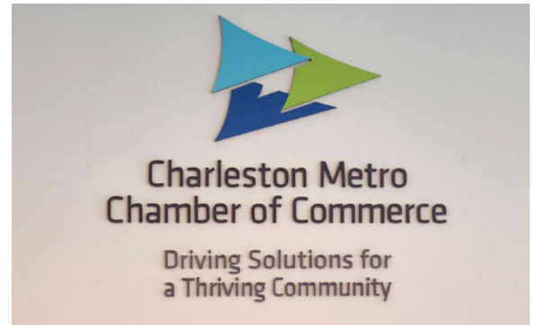
Logo printed and cut on acrylic.

We customize solutions specifically to your brand to enhance your office environment.