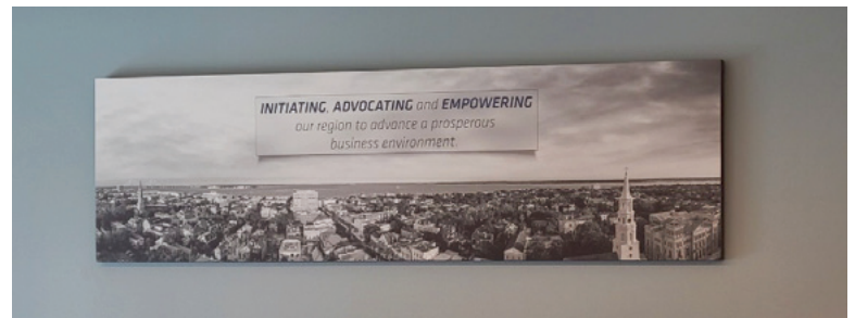
Wide poster printed on canvas.