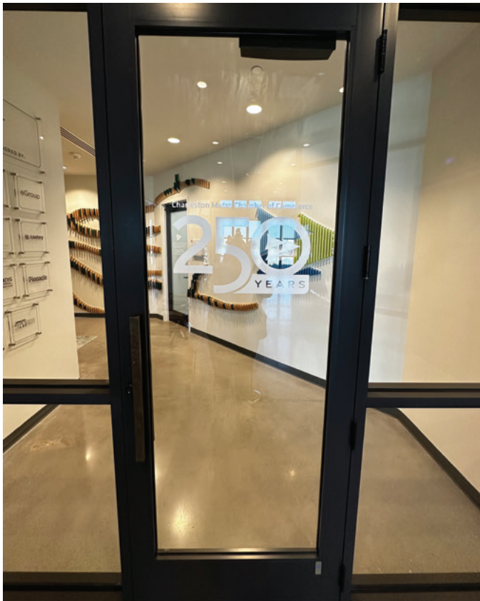
Frosted vinyl logo on glass