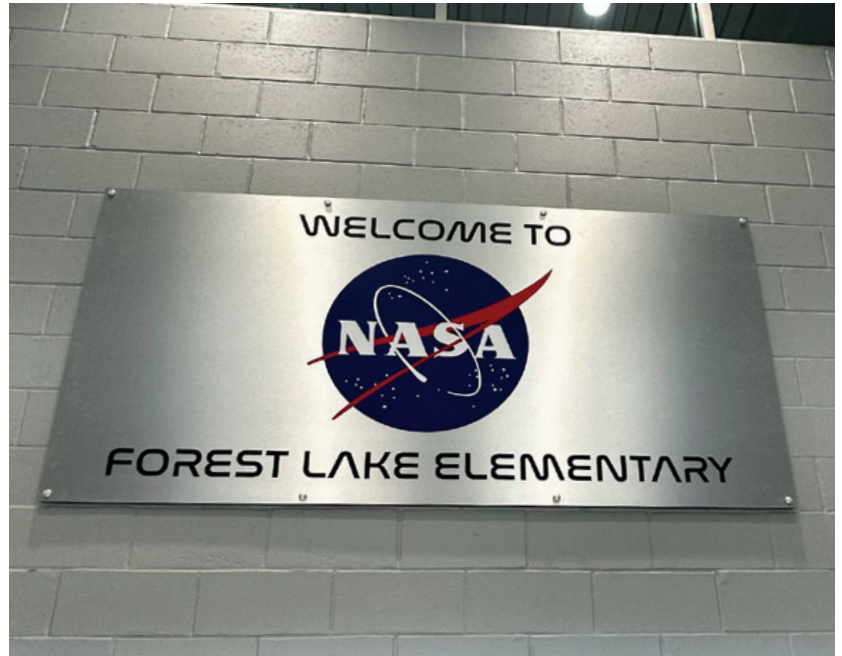
Letters and NASA logo are directly printed on brushed Aluminum Composite Material (ACM).

The school finds these resources to help ignite a lifelong love of learning in the elementary student and foster an interest in science, technology, engineering, and math. But it doesn't end there. The lessons learned through this unique program are integrated throughout the curriculum and provide the basis for school-wide programs and activities.