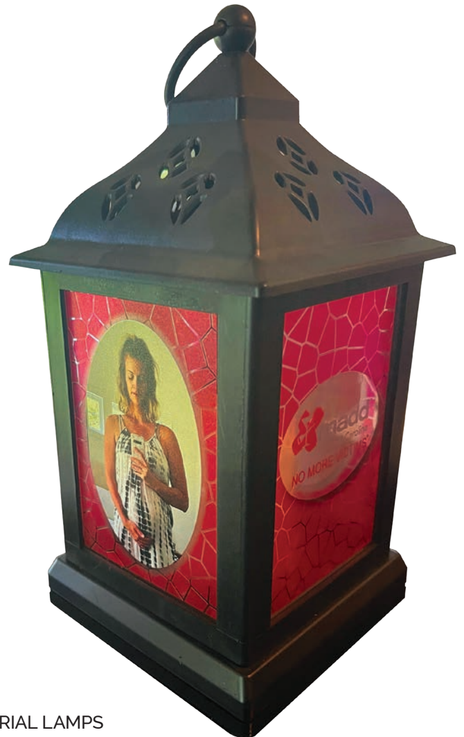
CUSTOM MEMORIAL LAMPS