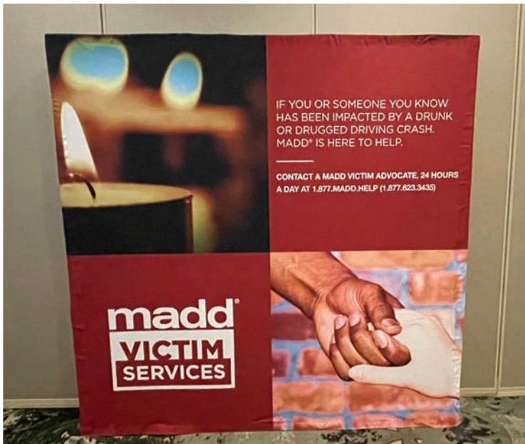
MADD VICTIM SERVICES DISPLAY